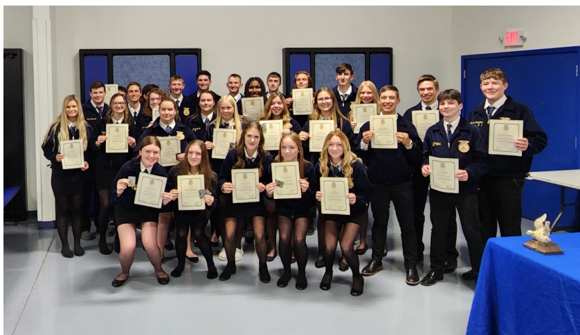
25 second year Russellville FFA members received their Chapter FFA Degree at the annual Russellville FFA Degree Ceremony.