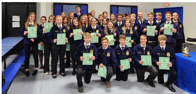
40 first year FFA members from the Russellville FFA Chapter received their Greenhand FFA Degree on Thursday November 9th, 2022.